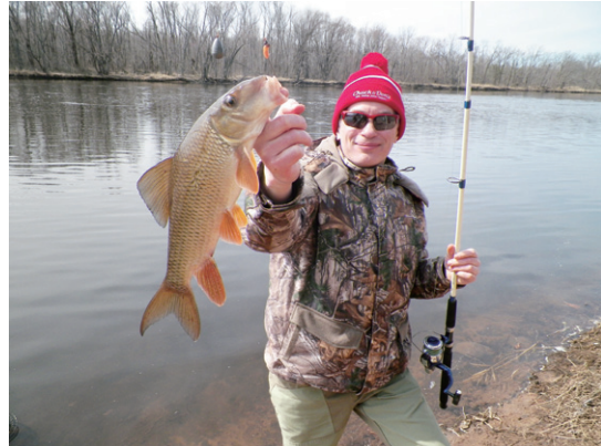
The author performing stage one of the Urashima effect experiment: fishing

periods. The aliens landed on Earth during the early Kamakura era and took the young fisherman on their spacecraft. Such extraterrestrial crafts at that time looked like flying saucers and thereby resembled the shape of a sea turtle. The aliens took Taro along for a few circles around the Milky Way at an unimaginable speed and performed nasty experiments on the poor guy. They wanted to find an explanation, obvious to any psychologist of the Freudian school of thought today, why, instead of beating on the outer shell of their spacecraft with sticks, like the younger generation of humans did, his brain took a different path and worked out a scheme of purchasing the unidentified lying object (ULO) for an undisclosed sum of money.