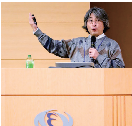
March 8: Giving an opening talk at the Symposium: MEXT Scientific Research on Innovative Area "Why Does the Universe Accelerate? – Exhaustive Study and Challenges for the Future –" held at KEK (see p. 16).