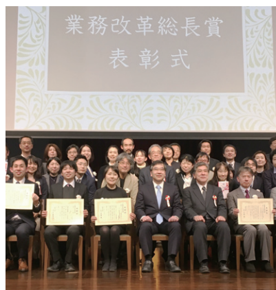
December 15: Award ceremony for the 2017 President's Awards for Business Transformation, held at the Yasuda Auditorium on Hongo campus (see p. 35).