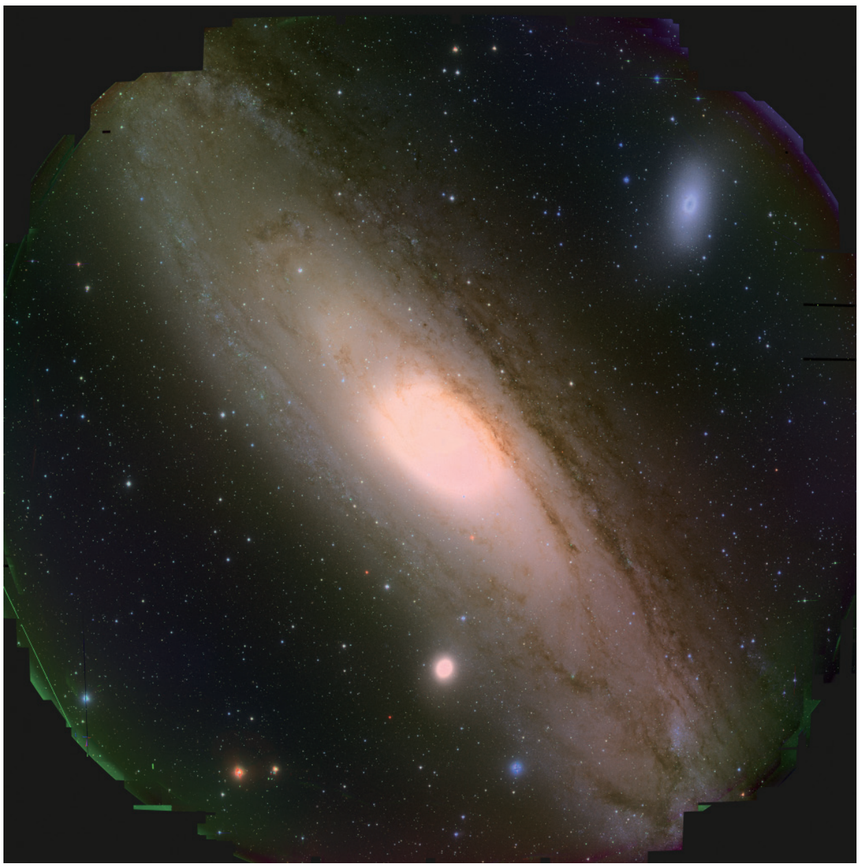
The full view of the Andromeda Galaxy taken by HSC. The HSC mounted on the Subaru Telescope can observe an extremely wide field of view, equal to 9 times the area of the full moon. The color image was made by combining the data of three filters (g, r, and i), each of which selectively transmits light in a particular range of wavelengths. Note that some parts at the edge region appear to be strange color since the boundary area of the image circle is hard to process and observed area is not perfectly coinciding between the 3 bands.

combination of imaging and spectroscopic galaxy data for the same region of the sky is extremely powerful to study mysterious nature of dark matter and dark energy. We are finally about to start our long journey of the massive Subaru cosmic census project.