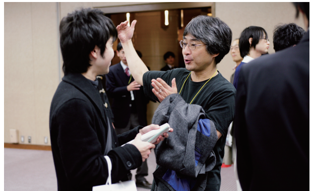
December 17: Answering questions asked by a high school student at the 4th Annual WPI Joint Symposium held at the Yurakucho Asahi Hall