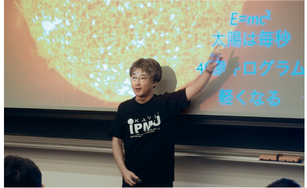
October 25: Lecture at Kashiwa Open Campus 2014