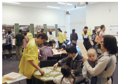
At a seminar room, graduate students explained poster presentations of the research conducted at the Kavli IPMU as well as math puzzles