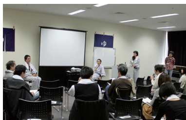
A scene of Science Onsen in Science Agora 2014