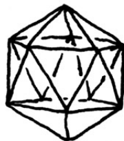
正二十面体 Regular icosahedron