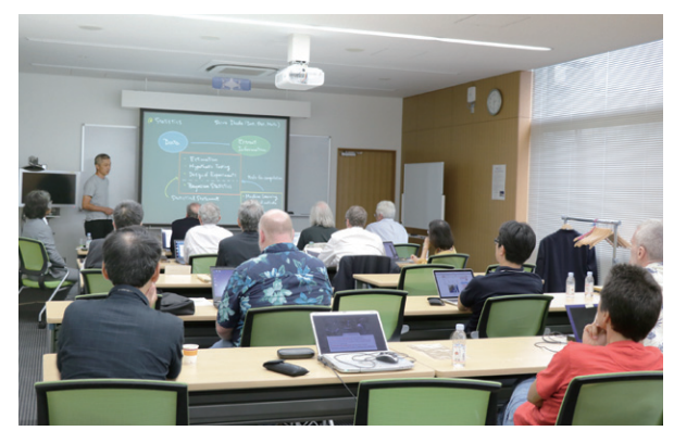
The author reports his research activities in collaboration with Kavli IPMU researchers to the External Advisory Committee of the Kavli IPMU on August 22, 2016.

Data science consists of theoretical and practical studies. As for the theoretical side, I have studied information geometry, which applies differential geometry to information theory and statistics. On the