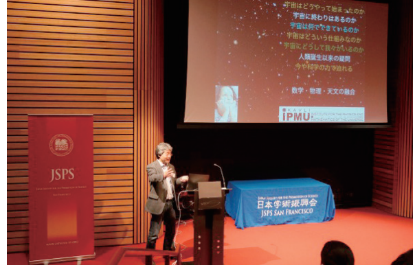
February 3: Giving a keynote lecture at the JSPS (Japan Society for the Promotion of Science) Researcher Reception, hosted by JSPS San Francisco Office.