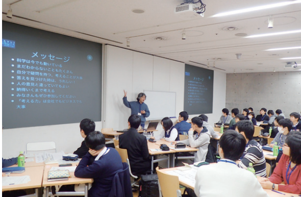
January 6: The 2nd lecture delivered at 2017 Collaborative Knowledge Creation Practical Learning Course, cohosted by the Kavli IPMU and the University of Tokyo Center for Research and Development on Transition from Secondary to Higher Education. Division for Cross-Stage Education and Assessment, CoREF. (For the 1st lecture, see Kavli IPMU News No. 39, p. 22).