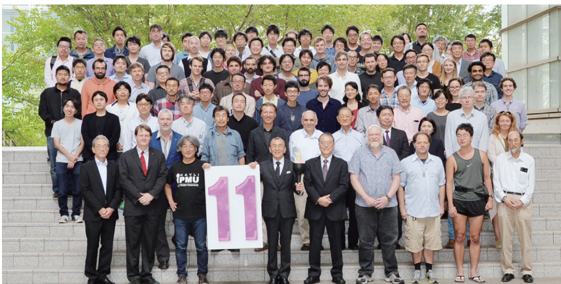
11th anniversary of the Kavli IPMU.